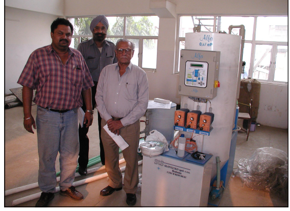
India—installation of wastewater recyling unit for oiled wastewaters from car washing, operations, New Delhi